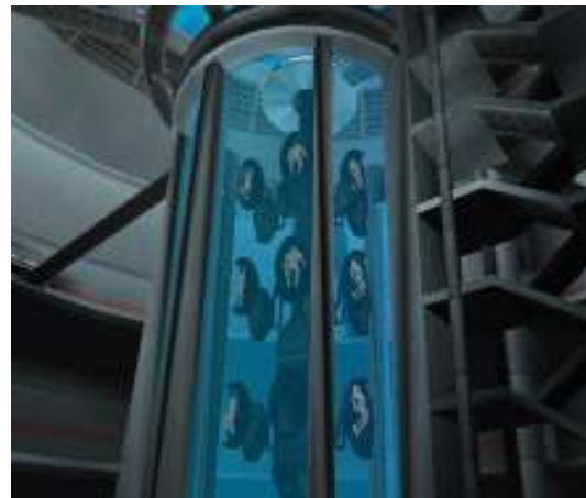
Inside the Biomare facility. File photo.

Sources for this article are not to be revealed for their own safety, and agreed to speak with Editor Ryan on the condition of anonymity. All statements and time line information is only speculation based on the information provided and in no way claimed to be absolute fact.