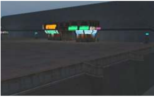
Entertainment Platform - Where Ross last stood

In times of uncertainty, there are always speculation and rumors. There have been all kinds of speculation on where Omni-Tek will go from here in reference to the Phillip Ross assassination attempt and the naming of the new CEO, Tarkhan Zora.